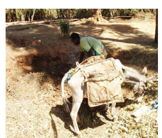
A farmer digging out compost to transport on a donkey to his khat farm, East Harerge, Ethiopia.