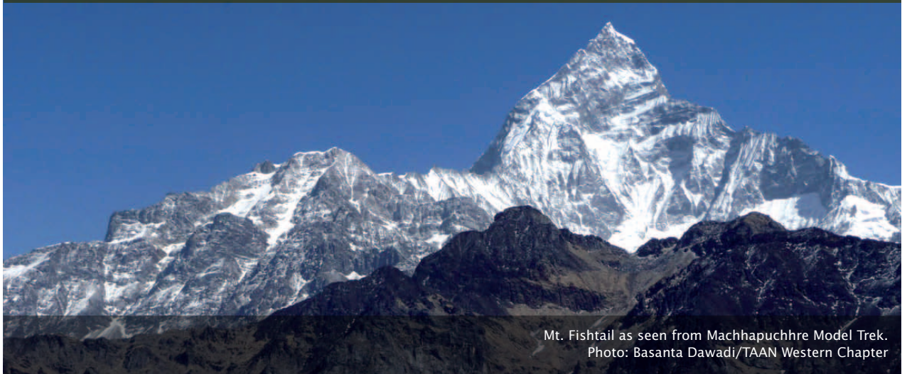
Mt. Fishtail as seen from Machhapuchhre Model Trek.