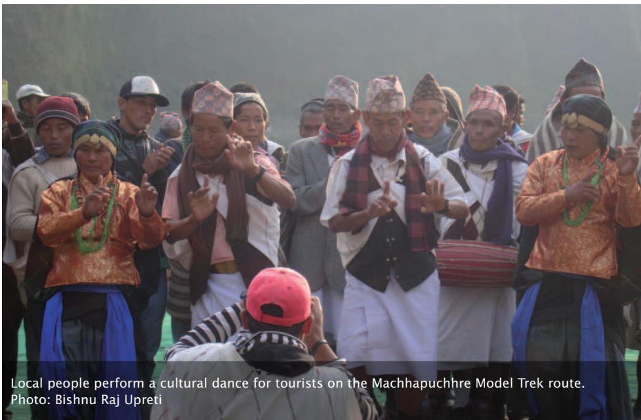
Local people perform a cultural dance for tourists on the Machhapuchhre Model Trek route.

Given the importance of tourism to Nepal, greater emphasis is needed on both research and education. A sufficient number of qualified researchers are essential to plan tourism enterprises at local and national levels and to develop information to guide policymakers. Tourism education must be strengthened and interlinked with the tourism industry to ensure that the industry is sustainable. Tourism education covers aspects such as culture, history, environment, and conservation that are intrinsically related to tourism. Shortcomings in such areas could disappoint tourists and damage local tour operators, employment, and foreign exchange earnings. Such harmful impacts are already visible in some areas which have neglected the conservation of Nepal's cultural heritage and local development. Improved tourism education would help avoid such problems.