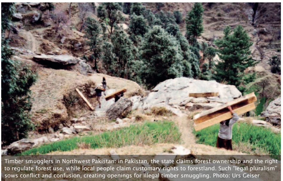
Timber smugglers in Northwest Pakistan: in Pakistan, the state claims forest ownership and the right to regulate forest use, while local people claim customary rights to forestland. Such “legal pluralism” sows conflict and confusion, creating openings for illegal timber smuggling.

In 1969, the Pakistani government extended its forestry legislation to areas in the Northwest that were previously governed by local customs. Overnight, forests were declared to be government property, greatly restricting the existing local use rights based on complex common law. Still today, many people see themselves as the genuine custodians of the forests and consider state regulations as an imposition. This explains in large measure why “joint forest management” (which involves both state forest departments and local communities) often has little success: it does not recognise customary institutions or locally important, deep-rooted regulations. Regulating forest use often reflects deeper social tensions, and addressing such issues requires a critical look at the balance of power (Shahbaz 2009, Geiser 2006).