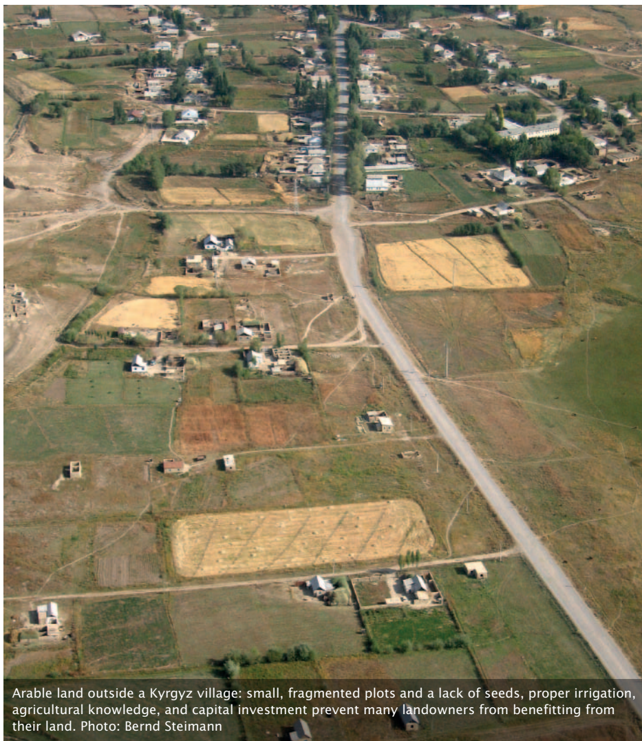
Arable land outside a Kyrgyz village: small, fragmented plots and a lack of seeds, proper irrigation, agricultural knowledge, and capital investment prevent many landowners from benefitting from their land.