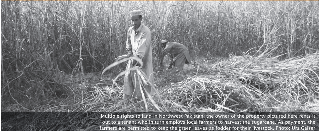
Multiple rights to land in Northwest Pakistan: the owner of the property pictured here rents it out to a tenant who in turn employs local farmers to harvest the sugarcane. As payment, the farmers are permitted to keep the green leaves as fodder for their livestock.