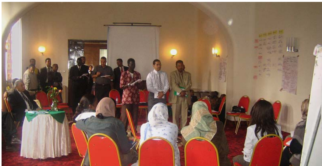
Figure 3: Nile Forum – gender exercise in the exchange between Egyptian, Ethiopian and Sudanese MA students, Addis Ababa, 2006.

The “Nile Capacity Building Forum on Water Development and Cooperation” 10 that took place in 2005 in Addis Ababa, brought together 10 participants from each of the Eastern Nile countries: Egypt, Sudan, and Ethiopia. Participants were Master’s level students at universities, young professionals in Water Ministries or Foreign Ministries, employees of water associations or of water and development NGOs or IGOs (AU) The facilitators at the workshop were part of the “Dialogue Workshops” series. The participants and facilitators also visited the NBI ENTRO office in Addis Ababa – and spoke in depth with Dr. Osman Hamad El Tom (another of the former Nile Dialogue Workshop series participants). The workshop was a unique combination of classical capacity building, interactive learning and a strong focus on exchange of perspectives. Rather than being an export of concepts from the North to the South, the workshop was designed and facilitated by trainers from the Nile countries, for participants from the Eastern Nile Countries. An institutionalized “Training of trainers” by local and regional experts would be an opportunity to further develop this type of capacity building forum.